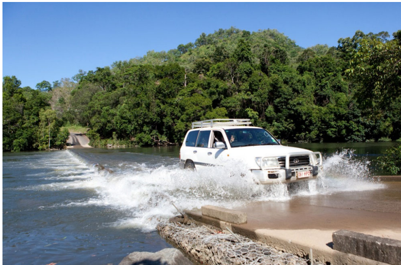
Old Bloomfield Causeway