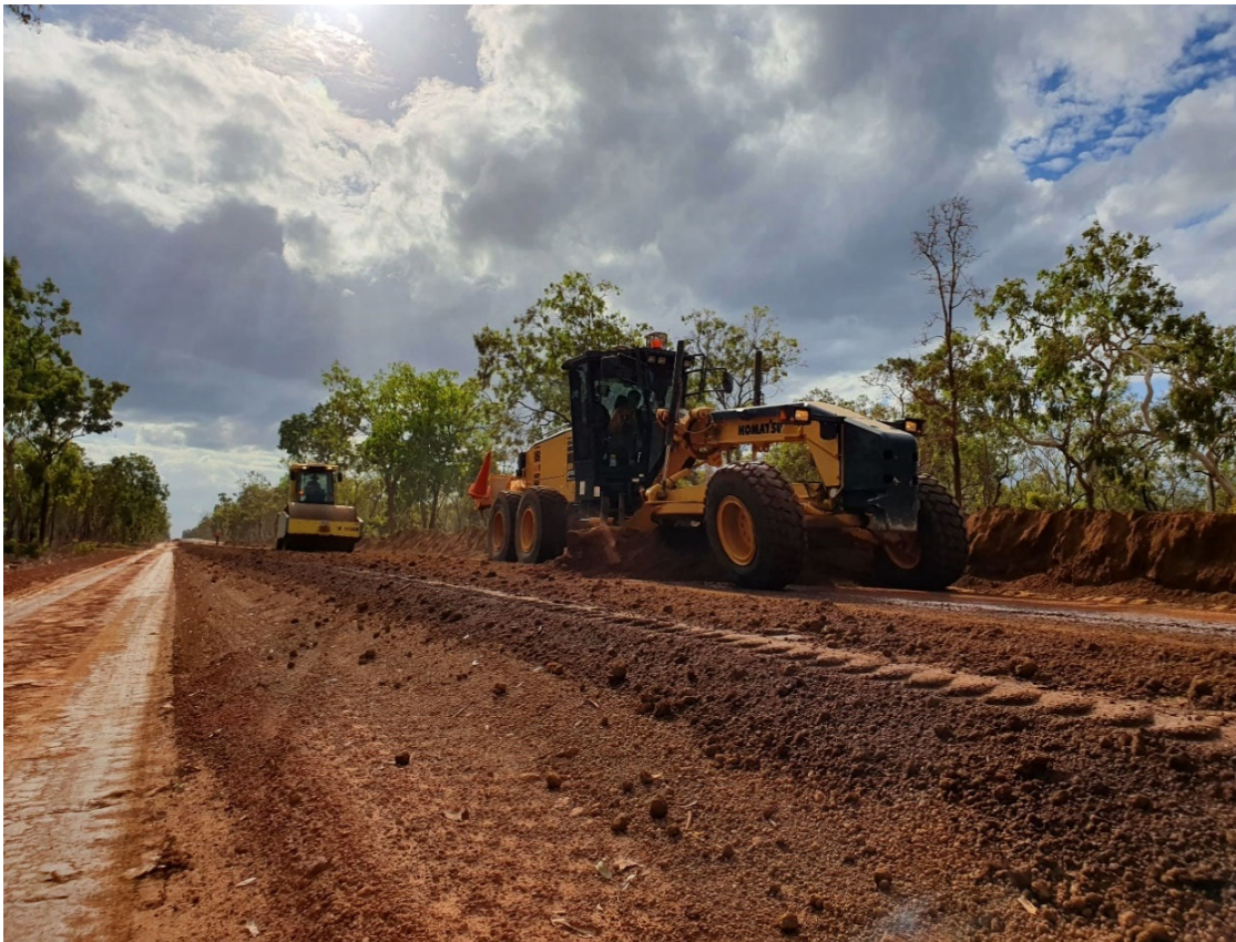
Aurukun Access Road – Bitumen Seal

Each parcel of rateable land will specially benefit to the same extent from the purchase and maintenance of equipment by each Rural Fire Brigade in the current or future financial years, because each such parcel is within the area for which the brigade is in charge of firefighting and fire prevention under the Fire and Emergency Services Act 1990 .