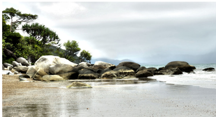
Quarantine Bay Beach - Cooktown