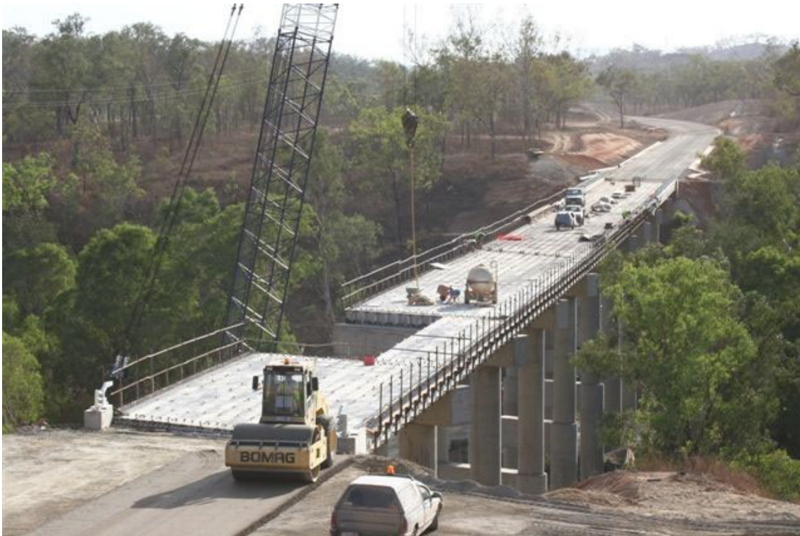
Building of the West Normanby River Bridge

Pursuant to Section 116 of the Local Government Regulation 2012 , for the 2021/2022 financial year, Council has not made, and will not make, a resolution limiting an increase of Rates and Charges.