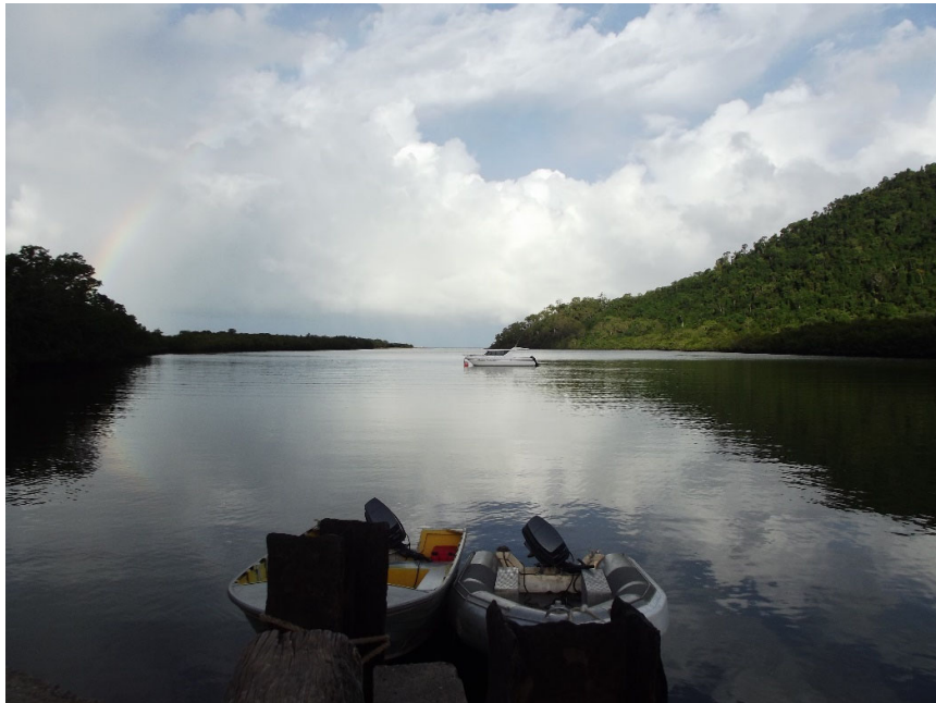
Boats on Bloomfield River

Water service charges are calculated per water meter as detailed in the table below. Vacant service charges to apply to all vacant parcels of land as well as all land that does not have planning approval for either residential or commercial use within the Coen, Cooktown, Lakeland and Laura Water Areas on the basis that a water service is available to the land as water infrastructure has been installed ready to supply the land once it is occupied. Water charges will be levied in two equal half yearly amounts.