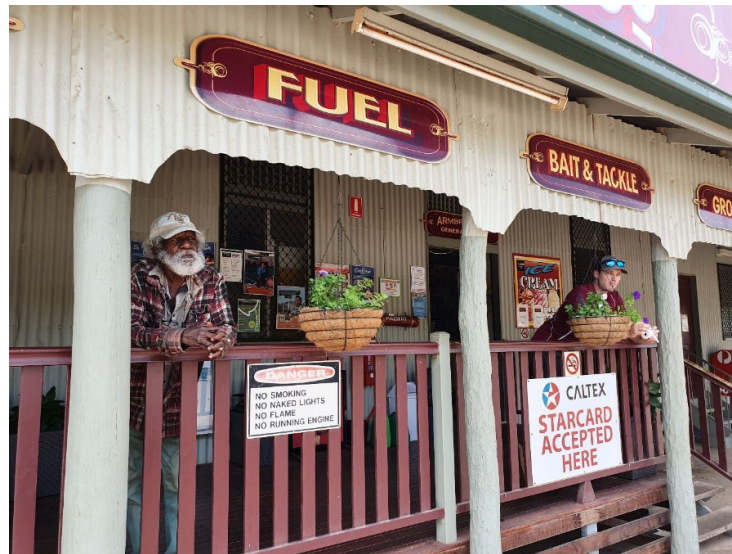
Armbrust & Co Store – Coen