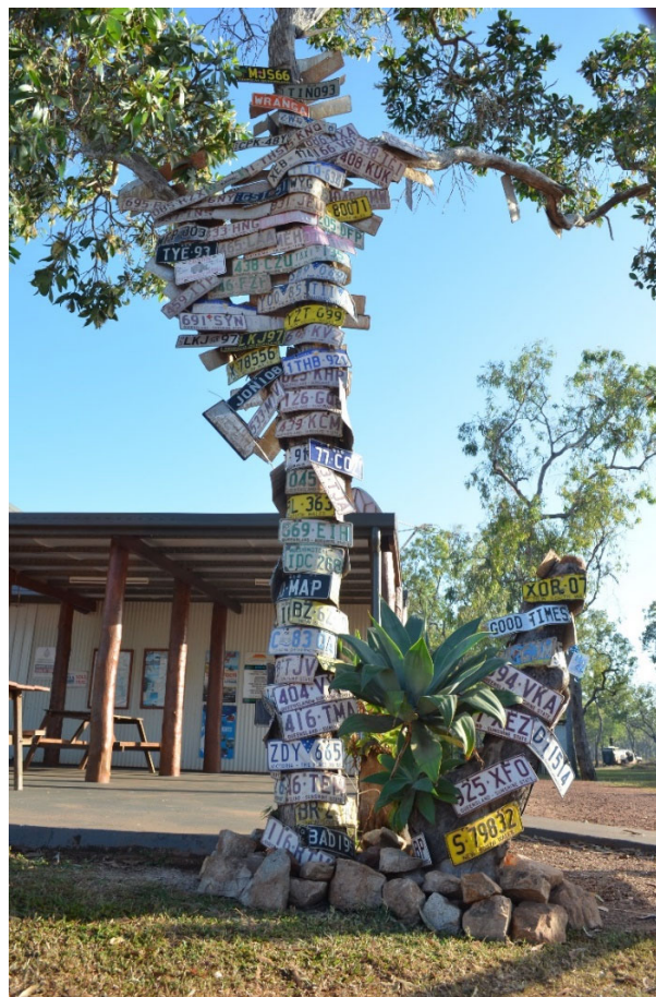
Bramwell Junction Roadhouse – Number Plate Tree