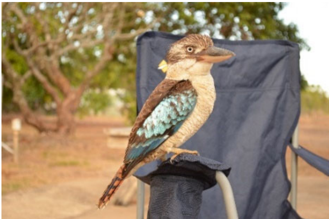
Blue Winged Kookaburra – Coen Airport