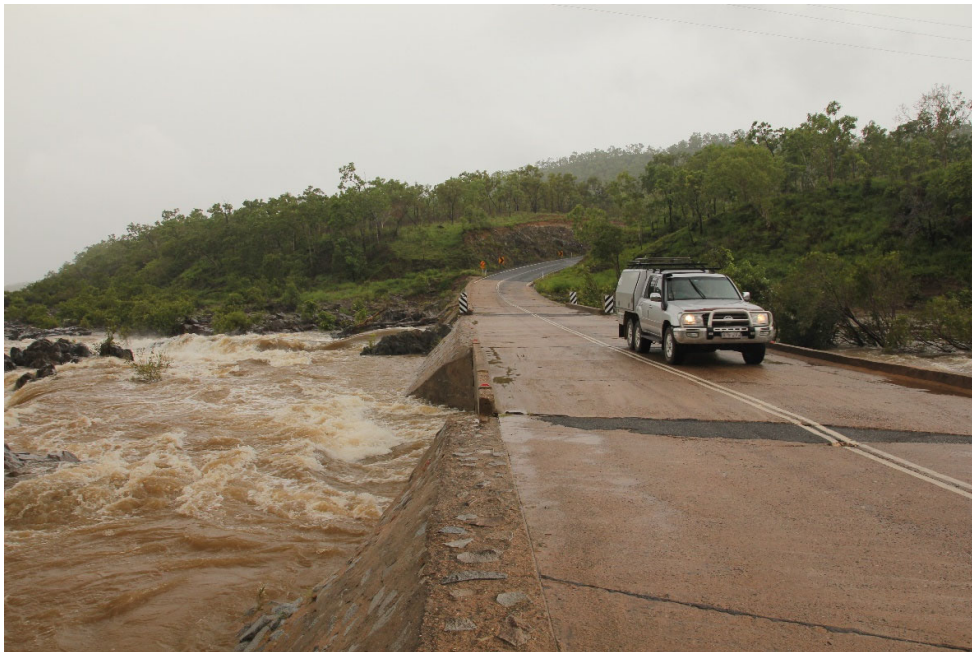
Little Annan Bridge

Applications http://www.cook.qld.gov.au/council/forms/finance-forms